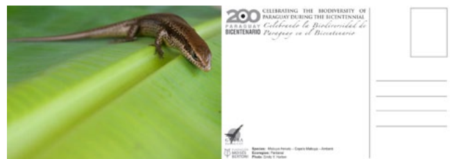
Postcards for Paraguayan biodiversity photo exhibit.