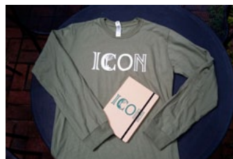
ICON logo used for fundraising & promotion